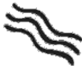
Fire / Smoke Water