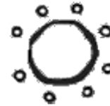
Star / Sun