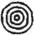
Waterhole / Campsite